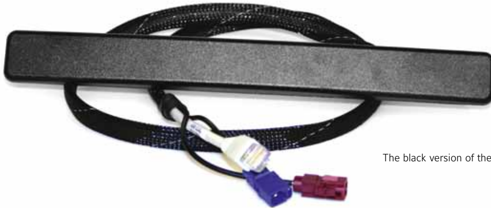
The black version of the antenna

Centralized remote management of reefer container operating conditions, alarms, events, settings and positions.